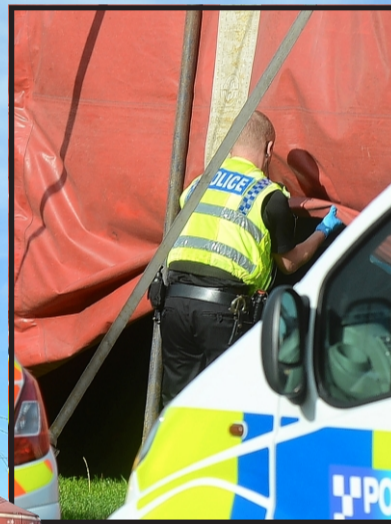
Police at Russell's Circus in Cleethorpes.